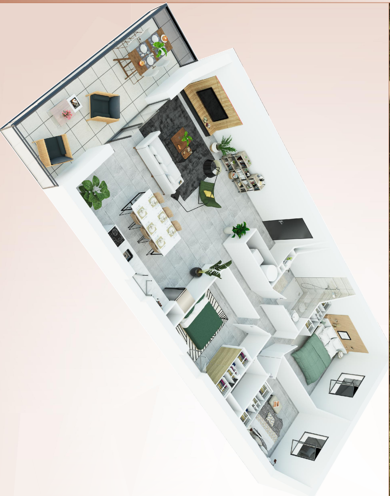
TABLEAU DES SURFACES BATIMENT C - LOT 36 - T4 - R+2